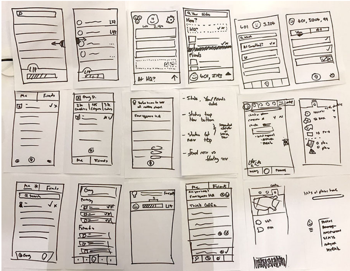
screen-mockups-all-versions.jpeg (178 kB)